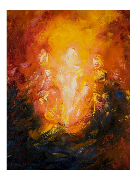
Transfiguration: Writing a Positive Future Story